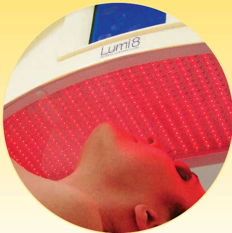
Treatments with red light at 630 nm promote skin healing